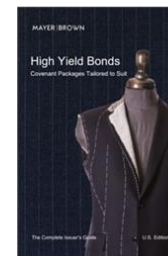
High Yield Bonds (2023)