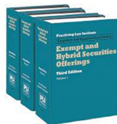
PLI's Exempt and Hybrid Securities Offerings (4th ed., 2022 update)