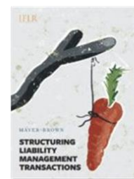
IFLR's Structuring Liability Management Transactions (2018)