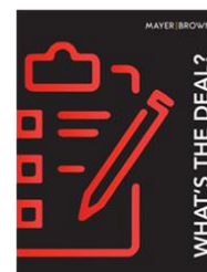
What's the Deal (2022)