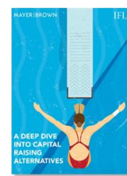
IFLR's A Deep Dive into Capital Raising Alternatives (2020)