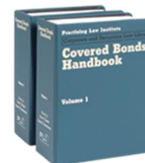
PLI's Covered Bonds Handbook (2014)